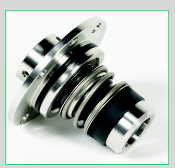
Slash Maintenance Time Up To 70%!

*Compared to seal replacement time of pump without cartridge seal system.