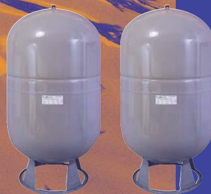
XT-XTV Series - Expansion Tanks